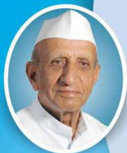
Founder & Visionary of K K Wagh Late Balasaheb Deoram Wagh