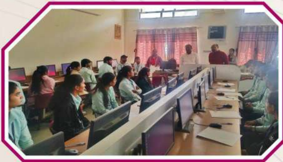
NutShell Infosoft Campus Drive