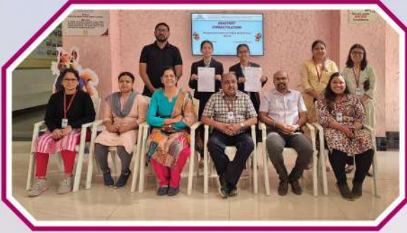
2 students of T.Y. B.B.A. got selected in Career Mantra with Package 2.20 LPA