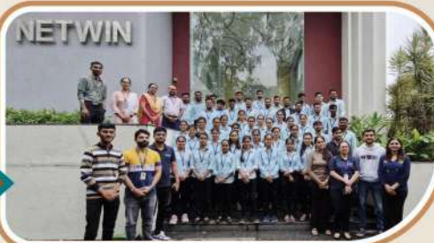
Industrial Visit, Commerce