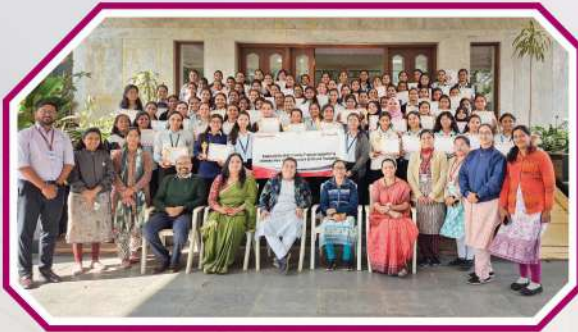
7 Days Mahindra Pride Training Program For Final Year B.Sc. (CS) and BBA (CA) Girl Students