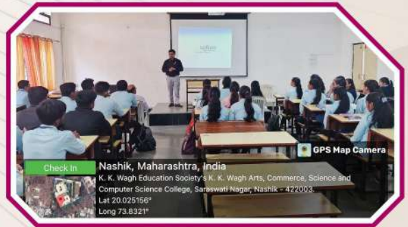
Upturn India PrePlacement Talk for M.Sc. (CS) Final Year Students 2024-25