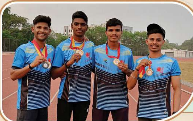
Athletic Zonal winner team