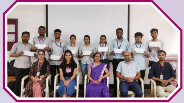
2 M.Sc. (CS) Students got selected in Narola Infotech With Package 2.64 LPA