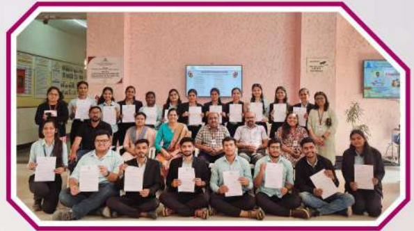
12 T.Y. BBA 12 T.Y.B.Sc. 1 T.Y. B.Sc.(Chem) total 25 students got selected in TCS with Package 1.94 LPA