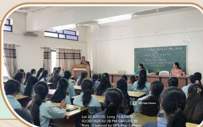
Workshop on girls personality & Self Defiance

BSW organizes special Guidance scheme for all first year students. Personality Development Programme & Karate Training activities are arranged under BSW. Earn and Learn scheme is available for needy students. Insurance scheme of Savitribai Phule Pune University is also available.