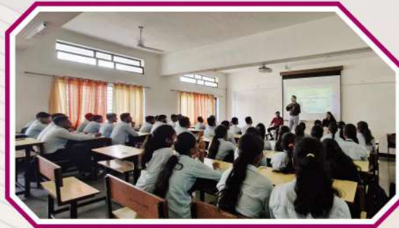
Eye On Universe Preplacement Talk For Final Year M.Sc. (CS) Students 2024-25