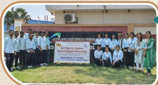
Industrial Visit, Science