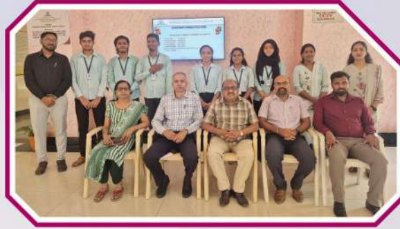
6 B.Sc. (CS) Students got selected in Wipro for their M.Tech Program With Package 2.20LPA