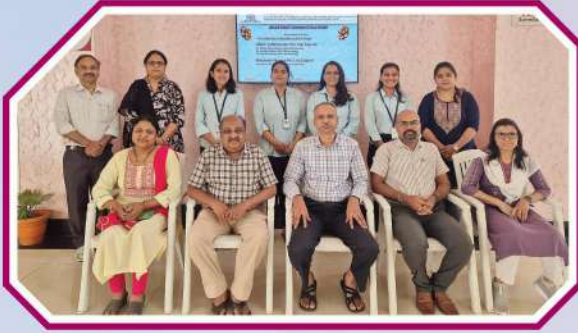
2 M.Sc. (Biotech) & 1 M.Sc. (Chem) students got selected in Alkem Labs, 1 M.Sc. (Chem) Student got selected in Maclodes