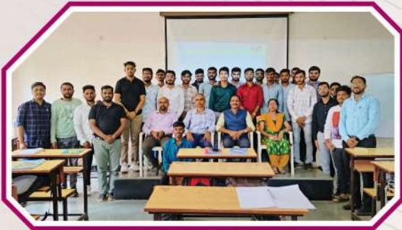
Barclays SoftSkills Training Program For Final Year M.Sc. (CS) 2024-25 Batch Students