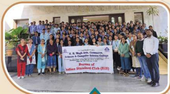
Bureau of Indian Standard Club